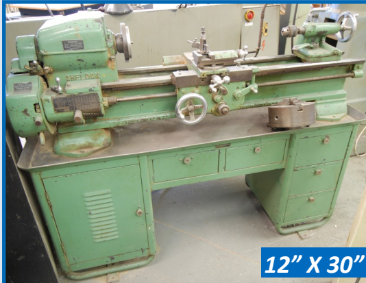
12" X 30"