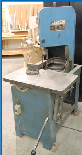
VERTICUT & CENTAURO BREVETTA BANDSAWS