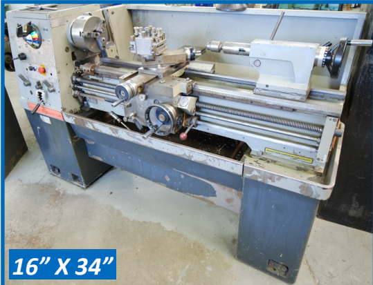
16" X 34"

1996 Takumi Seiki V11A CNC Vertical Machining Center, Mitsubishi Control, 24 ATC, 53.15" x 20.08" Table, 800kg Max Table Load, Travels: X-43.31", Y-21.65", Z-25.59", 6,000 RPM, BT40, Habor Coolant Pump, s/n G0417