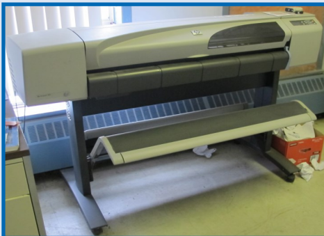
HP DESIGNJET 500 PLOTTER

Kenneth Fraser Electric Lift Cart, 1,500lb Cap. CMM Granite Surface Table, 79"x59"x12", 6 Adjustable Support Legs, Grade A (Located at 391 Marwood Drive, Unit 7, Oshawa, ON) Techquip Tank Type Air Compressor, 3HP HP Designjet 500 model C7770B Plotter, 43" Cap., s/n SG5C2B103C Plus: CAT40 & BT40 Tool Holders, Tool Holder Carts, End Mills, Drill Bits, Angle Plates, Rotary Tables, Machine Vises, Pallet Jacks, Height Gauges, Precision Instruments, Hand Tools, Workbenches, Letter & Number Punch Kits, Hold Down Kits, Collets, Bench Grinders, Office Furniture, and Much More!