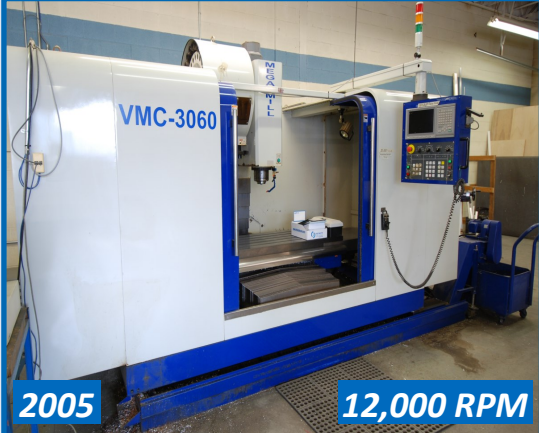
2005 12,000 RPM