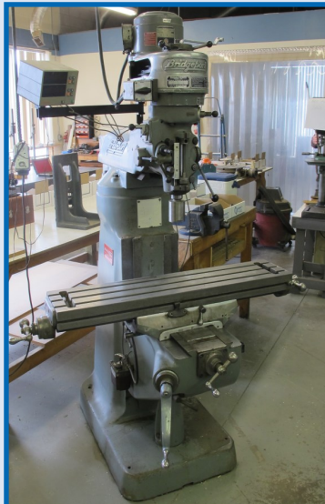
BRIDGEPORT MILLING MACHINE