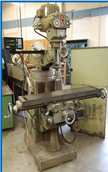
EX-CELL-O MILLING MACHINE

Visit infinityassets.com to view complete specs & additional photos